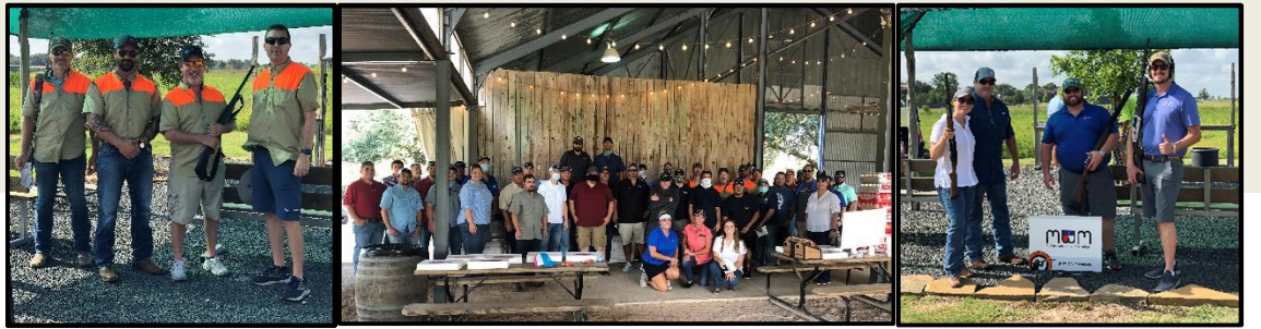
2020 UCTA Clay Shoot Participants and Volunteers